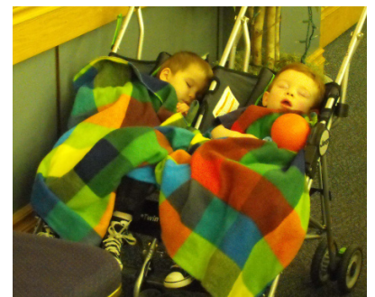
Some of us had the luxury of a quick nap to recharge (the adults were jealous!)

AS YOU CAN SEE THE PICTURES TELL IT ALL!!!