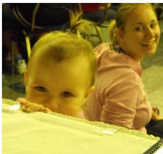
It was a very busy day with lots of dancing and playing and SMILES!